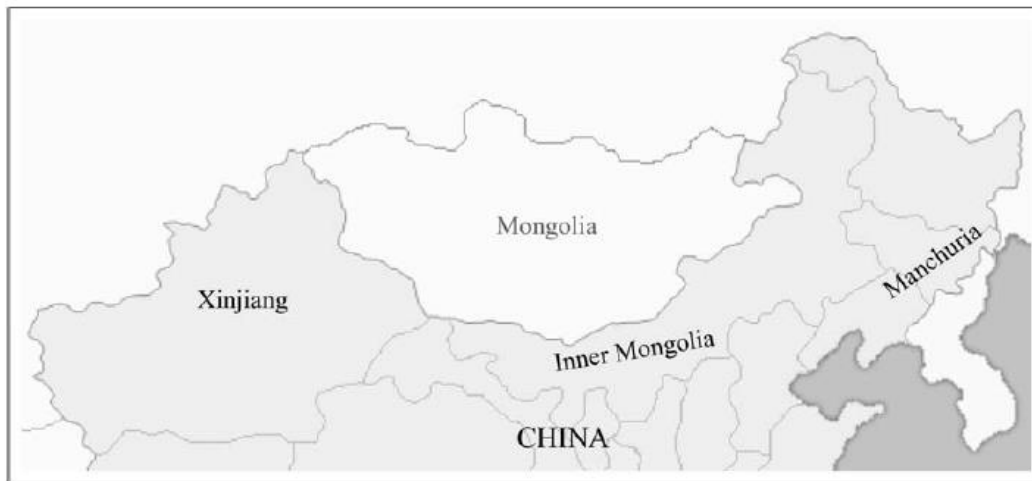
Figure 2 Three sub-regions of the Northern Zone: Manchuria, Inner Mongolia, Xinjiang (shown with modern-day geopolitical borders) (Eng, 2007, p. 19).

This part of Inner Asia can usefully be divided into sub-regions, defined by geographic features and climatic conditions. In one scheme, these include: north China and, from east to west, Manchuria, Mongolia (including Inner Mongolia), and Xinjiang (Barfield, 1989). In another scheme, they include, again from east to west: Manchuria, the Chifeng region (in Inner Mongolia), the Ordos region, and the Gansu corridor (Shelach, 2009). For the purposes of this research, I propose the use of three sub-regions: Manchuria, Inner Mongolia, and Xinjiang (after Eng, 2007, derived from Barfield, 1989) (Figure 2). Any investigation of the subsistence transition should keep these general divisions in mind, to acknowledge that ecological and other conditions were not constant, and that the transition is unlikely to have proceeded in the same way or at the same speed across the entire Northern Zone. Indeed, archaeological evidence points to this lack of homogeneity.